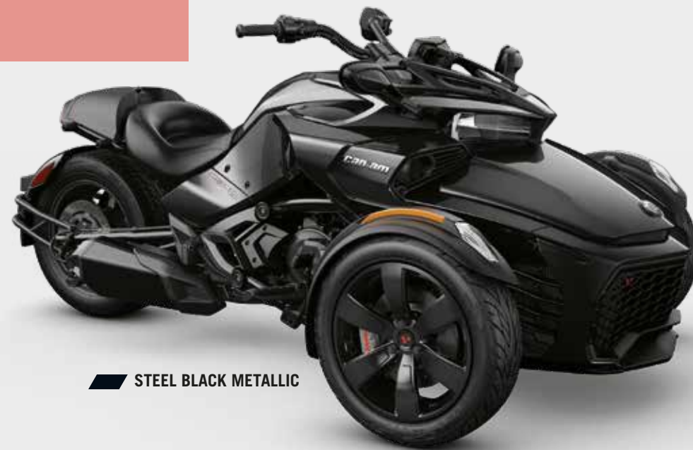
STEEL BLACK METALLIC